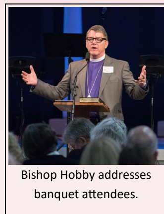
Bishop Hobby addresses banquet attendees.

The Certificate program restores the original mission of Church Army, which was to equip the church with evangelists who would reach people outside its walls who would ordinarily never come into the church. You can sign up for the Certificate Program here .